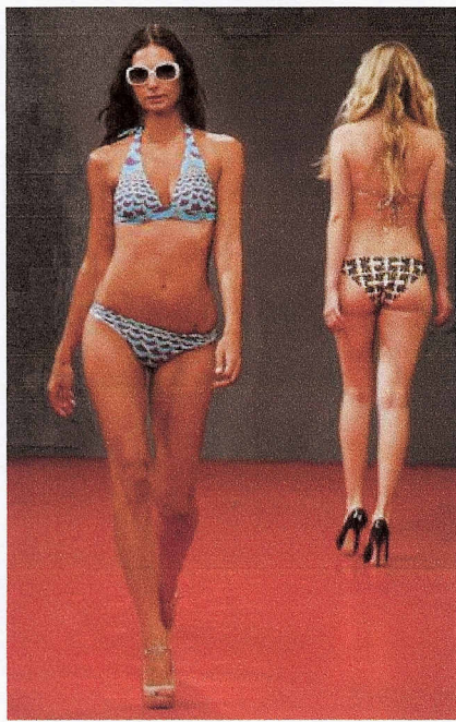
Styles on the runway at last year's Mare d'Amare.

responsible fair [...] Our core strength lies in our team and the relationship between the companies and the trade fair organization," he said in a statement. "We are talking about a more modern and innovative approach, with the aim to produce services and value in a constant connection with companies, where the good relationship does not turn on and off just in a few days but must guarantee continuity, transparency and therefore reliability."